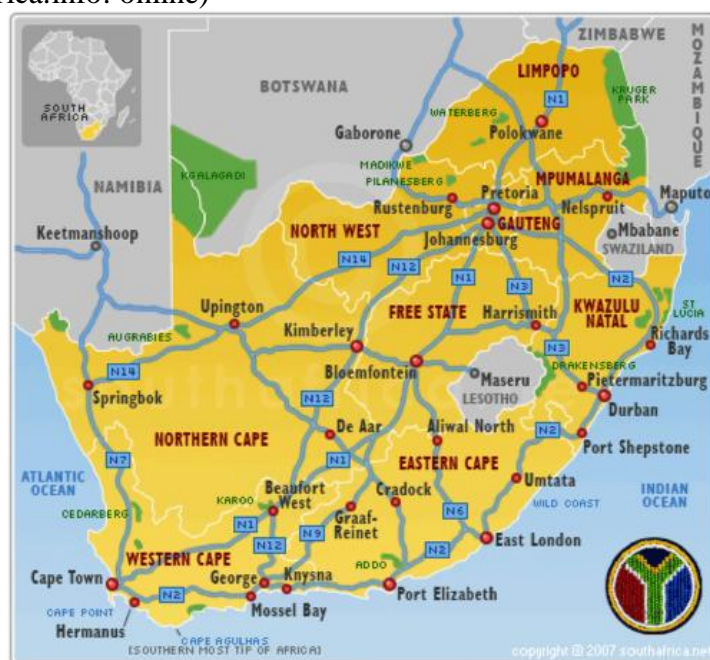
Figure 1. Map of South Africa

The Republic of South Africa is a country at the southern tip of Africa and has a population of approximately 49 million people (SA statistics online). It has nine provinces, Eastern Cape, Free State, Gauteng, KwaZulu Natal, Limpopo, Mpumalanga, Northern Cape, North West and Western Cape. According to the mid-2006 population estimates (southafrica.info: online), most people live in KwaZulu Natal (9.9 million) and Gauteng (9.5 million). Gauteng is the smallest province with only 16 548 square kilometres but is the most densely populated province with 526 people per square kilometre. The largest but least densely populated province is Northern Cape with 372 889 square kilometres but only three people per square kilometre (southafrica.info: online)