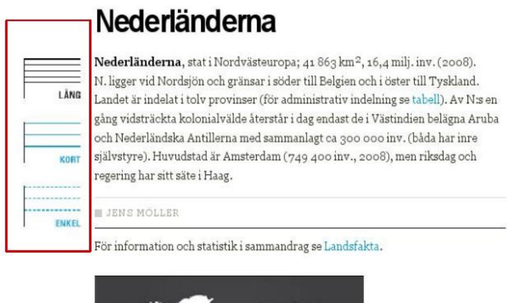
Figure 6. The Swedish National Encyclopedia offers up to three different presentations of the same article

Because most e-dictionaries available today were conceived as print dictionaries, the data structure is often less than optimal, with the consequence that the profiling potential is not fully exploited. Even if incorporated from the outset, the creation of an optimal data structure can be a costly affair: it takes more time and effort to present the same content in different versions no matter if it is done by creating separate versions or by marking up stepwise condensations of the full text. Nevertheless, it is an obvious and highly recommendable way of differentiating between user needs, and one which is also implemented in some reference works. To my knowledge, it is more widely used in encyclopedias and specialized dictionaries, probably because they often have very long and detailed explanations. The long explanation is useful for users that seek in-depth knowledge of a particular subject but they can be too long if the consultation is motivated by a simple reception problem. In the latter case the user is better helped with a short definition. Figure 6 shows an example from the Swedish National Encyclopedia where the user can choose between up to three different styles: 'lång' (long), 'kort' (short) and 'enkel' (simple). Another example is the Danish Dictionary of Music which offers a long and a short explanation of the head-word.