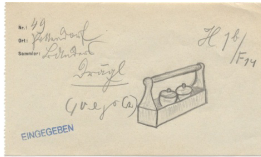
Figure 1. Voucher to be digitized in the DBÖ

Most of these data is already stored electronically. However, the so called Database of Austrian Dialects and Names (DBÖ) does not meet the needs of modern electronic storage of data. Therefore and for the reason to create new possibilities of data-access the project dbo@ema was designed by the project leader in 2006 2 : A new system is going to be established and data are transformed into this new system.