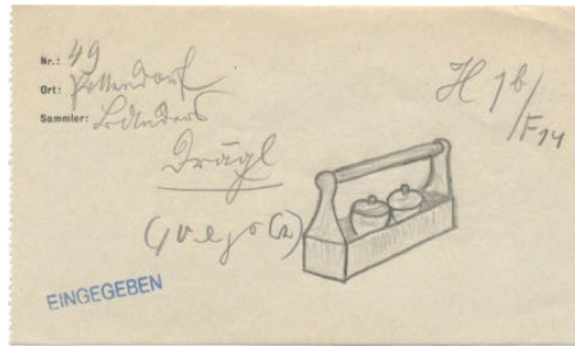
Figure 1. Voucher to be digitized in the DBÖ

Most of these data is already stored electronically. However, the so called Database of Austrian Dialects and Names (DBÖ) does not meet the needs of modern electronic storage of data. Therefore and for the reason to create new possibilities of data-access the project dbo@ema was designed by the project leader in 2006 2 : A new system is going to be established and data are transformed into this new system.