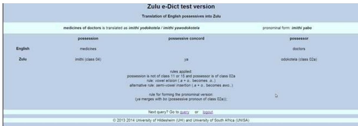
Figure 5: Webpage resulting from a query with a noun of class 2a as possessor (usually beginning with o-) and a noun of a class where the possessive concord ends in -a as possession.

deem correct in one of the next versions of the dictionary. The system is then to compare the user’s input with the correct output and, in a first stage, it will inform the user whether his/her input was correct or not. However, we will ask each user whether (s)he will give his/her consent to store the given data. If this consent is given, the input plus the attempted and the correct output will both be stored in a log file. We hope that these data will help to investigate typical learners’ mistakes and incorrect generalizations. Depending on the output, we hope that in future the system can be enabled to dynamically offer appropriate feedback. These feedback messages, like the log file, are not planned to be personalized, but will only depend on the given inputs.