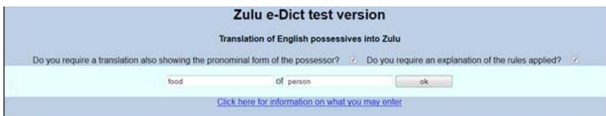
Figure 2: Start page: user requires translation of “food of person” plus rules plus pronominal translation of the possessor.

Though the website design is preliminary, we show screenshots in Figures 2, 3 and 4 in order to demonstrate our implementation principle: keep it simple and intuitive. In the header, the user is asked what kind of information (s)he requires over and above the translation which is done in all cases. Checkbox 1 on the left asks whether the user would like to have a pronominal version of the translation (i.e. the possessor noun being replaced by the pronoun belonging to the same noun class) – in addition to the full translation as Zulu uses different pronouns dependent on the noun class they belong to, hence the pronouns “it” or “they” has several translation equivalents, dependent of the noun class of the noun that it stands for. If we ask the user what possessor the pronoun stands for, it will be possible to identify the noun class of this noun so that the tool can choose the right pronoun.