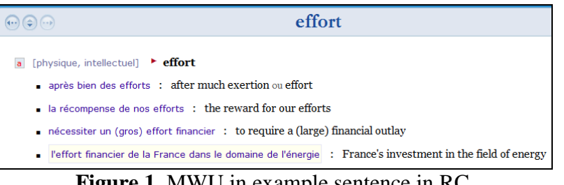
Figure 1. MWU in example sentence in RC.

Many of the chunks included in this category are quite complex and would deserve a less cursory treatment. Including MWUs in an example sentence does not only make them less visible (cf. Bentivogli & Pianta 2002), it also has two other main drawbacks: (1) the units are highly contextualised; and (2) in most cases, only one of the possible translation equivalents is mentioned. This is the case, for example, for dans le domaine de which RC includes in an example sentence in the entry for effort (cf. Figure 1).