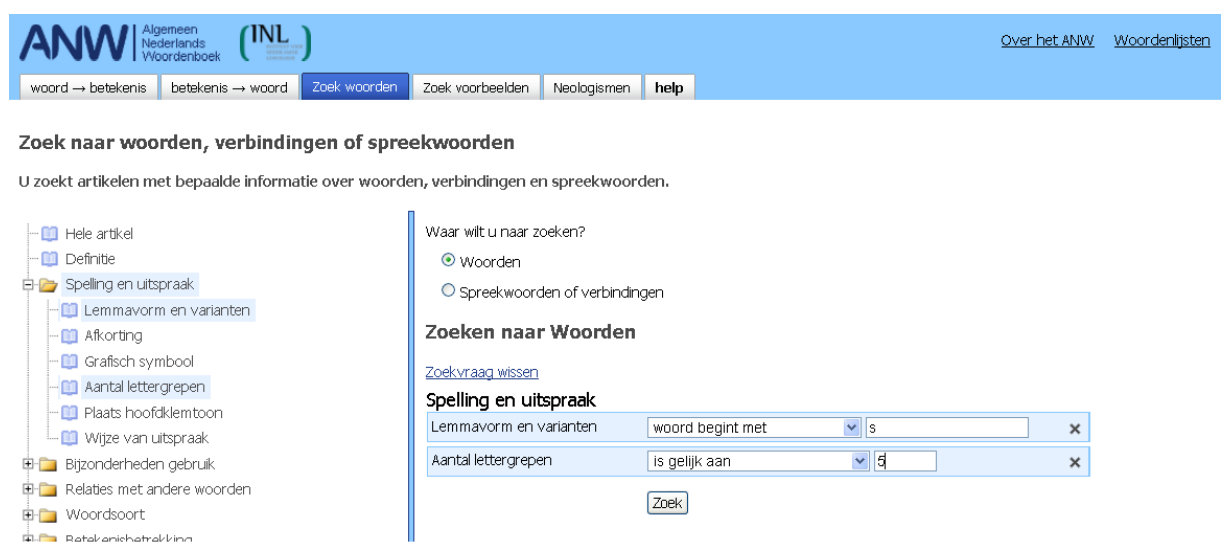
Figure 3. Illustration of search option Features → Words

All search options support the use of wild cards, and the input undergoes some linguistic analysis including stemming and removal of stop words. The results are ranked by relevance, but other sorting options are offered as well.