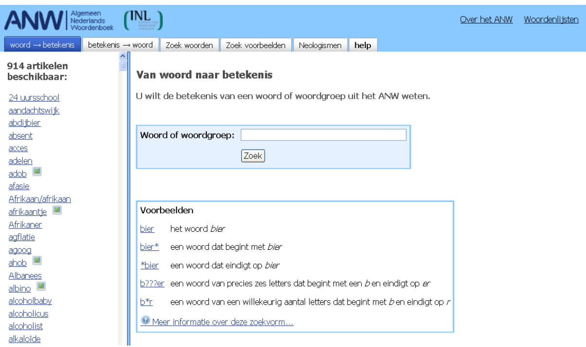
Figure 1. Illustration of the different search options in the user interface